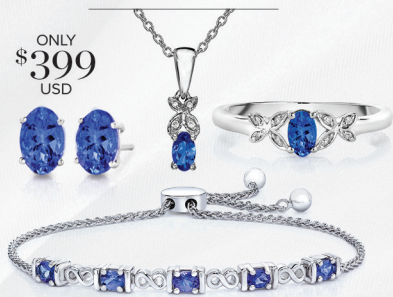
Tanzanite Oval Four-Piece Set

Exclusively at DI DIAMONDS® INTERNATIONAL LUXURY REDEFINED United States • Caribbean • Central America • Mexico