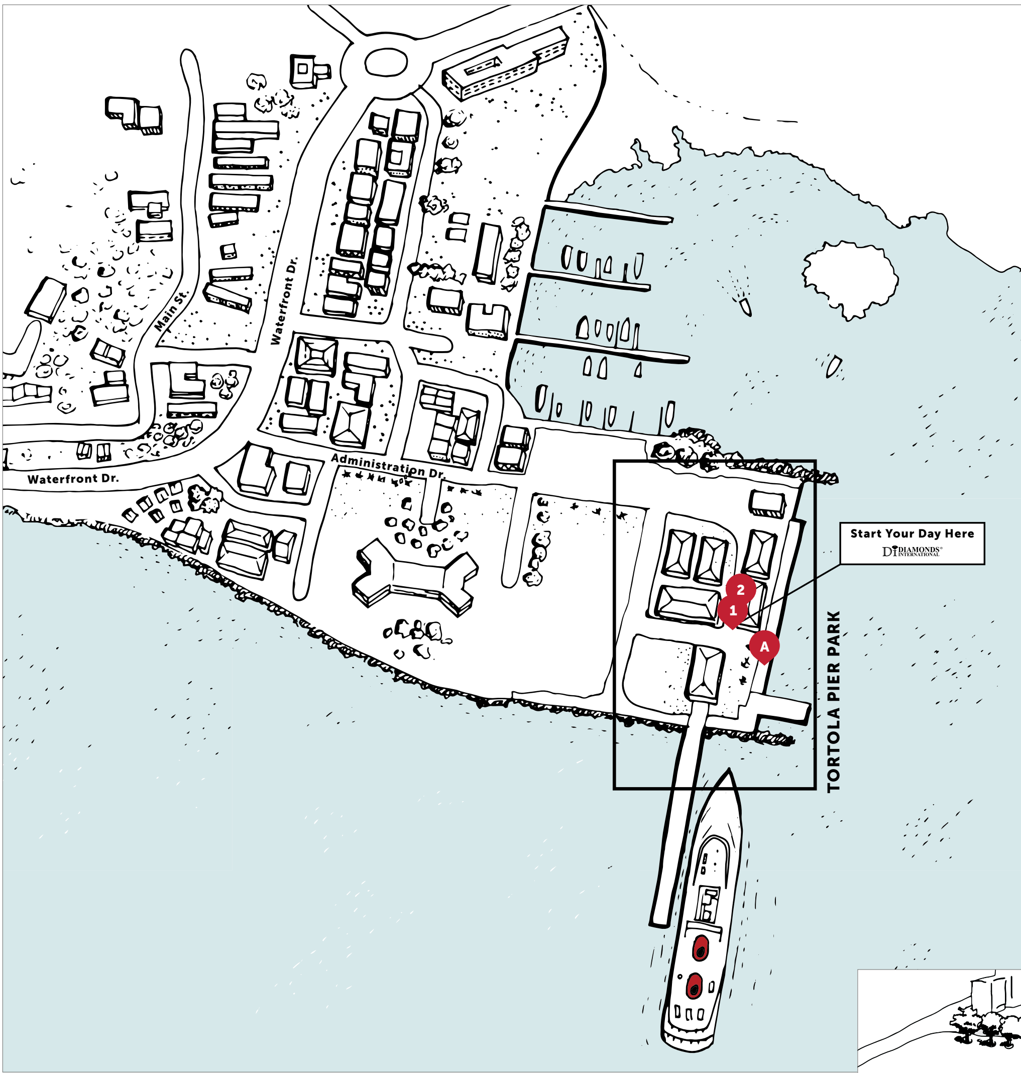
PHOTO OPPORTUNITIES: A ♦ Waterfront This guide is specially prepared by Real Focus Media and our Shopping Ambassador Program and is intended to assist you during your visit to this port. Please note that the information and prices provided in this map are subject to change without notice. We apologize for any inconvenience, but Disney Cruise Line cannot accept responsibility for any deviations. Thank you.